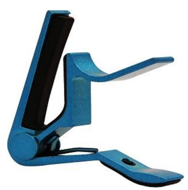
Benefits of 5 Core over other products